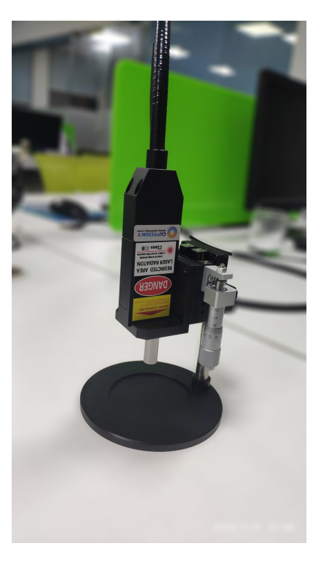
Figure 4 Fine adjustment stand (for solid and powder measurement)