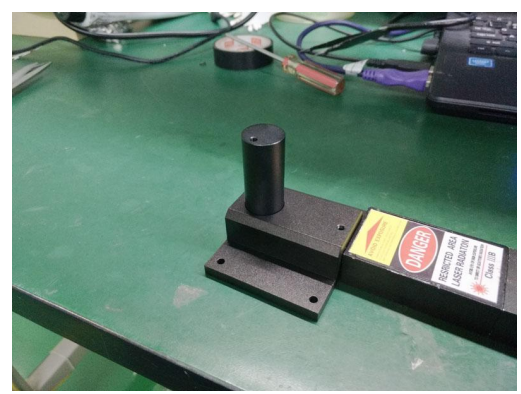
Figure 2 Liquid sample measuring cell (LC bottle, micro volume) (optional)