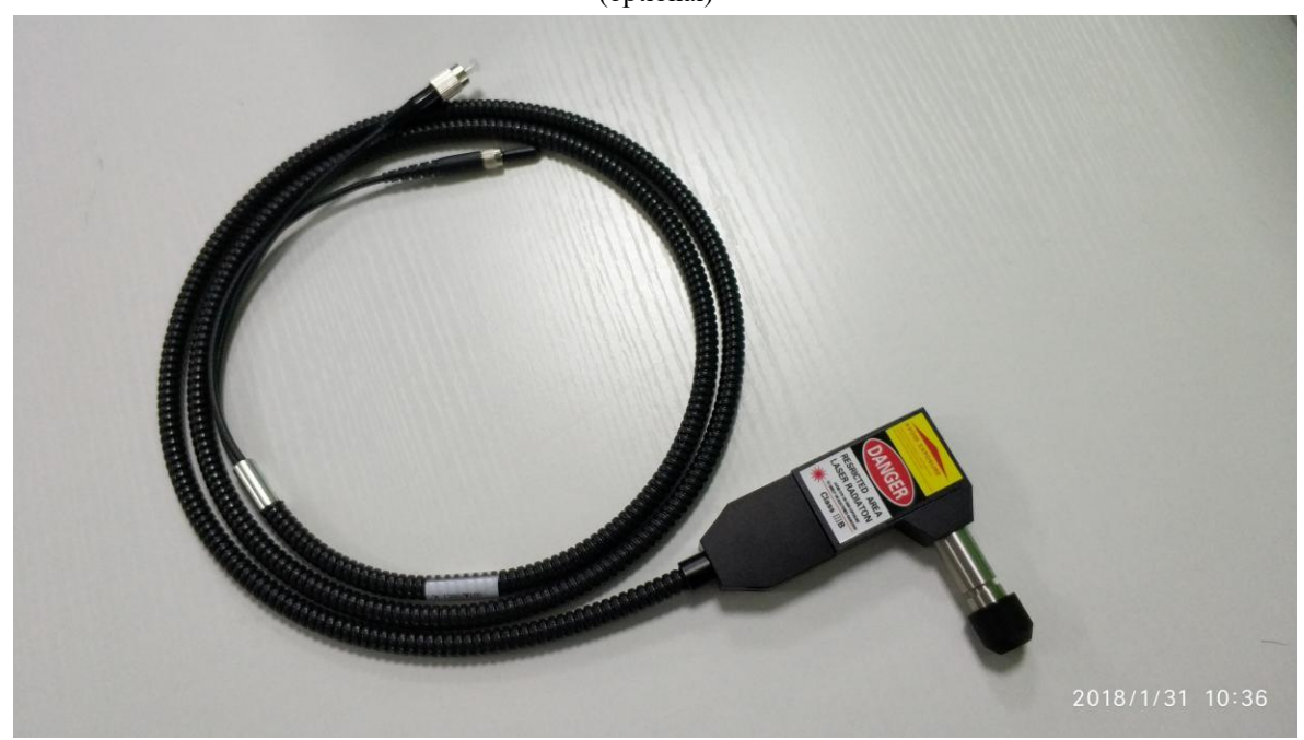
Figure 3 ATR20107 gun-type Raman probe (optional)