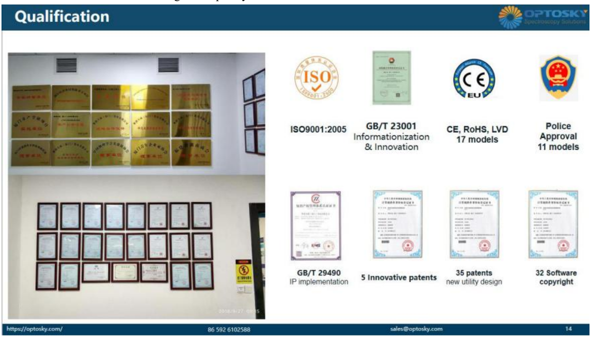
Figure 4 Qualification