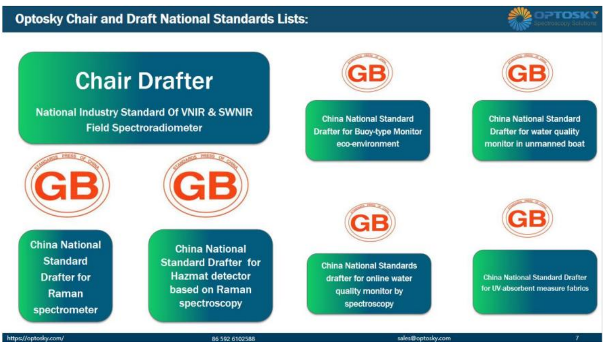
Figure 3 Optosky Chair and Draft National Standards Lists.