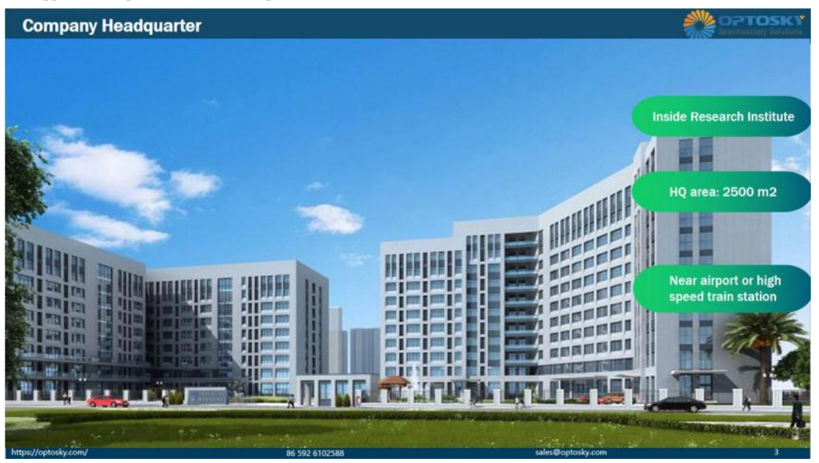
Figure 1 Optosky (Xiamen) Photonics Inc. Company Headquarter

The company received ISO9001:2015 certification, CE certification, Police Administration Certification, FDA approval compliant, IQOQPQ compliant.