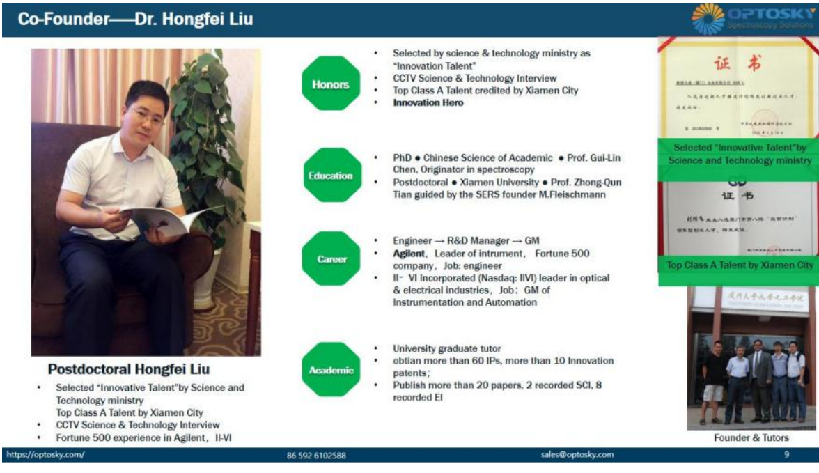
Figure 6 Optosky's Co-founder_Dr. Hongfei Liu