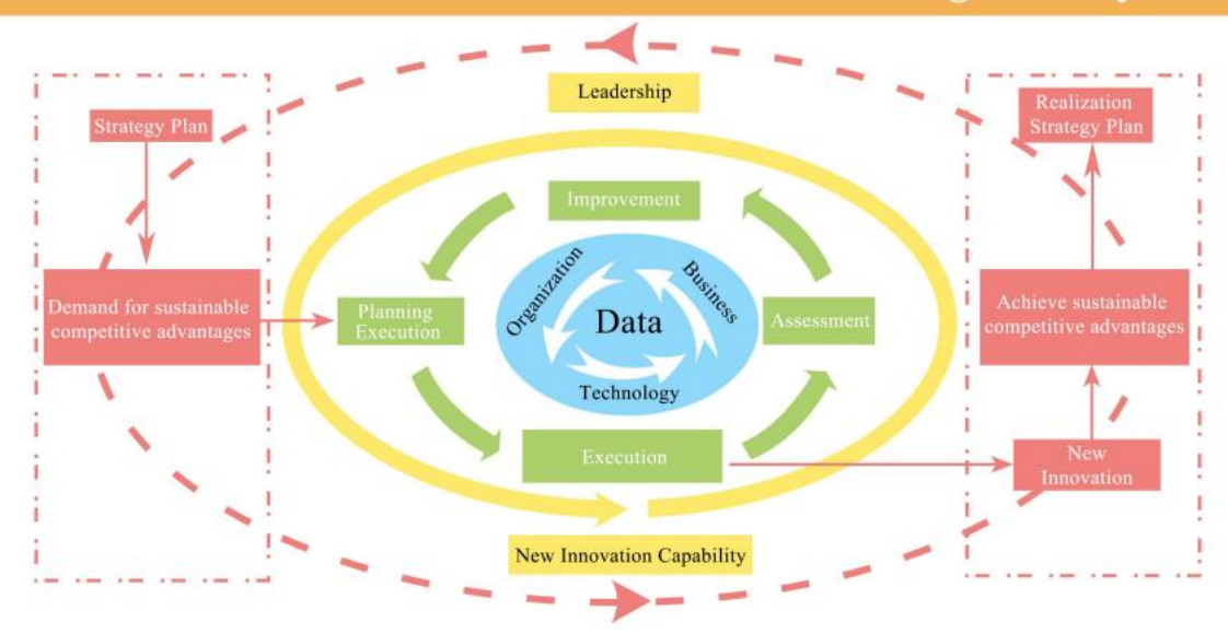
Figure 5 GB/T 23001 Informationization & Industrilization Fusion Management System