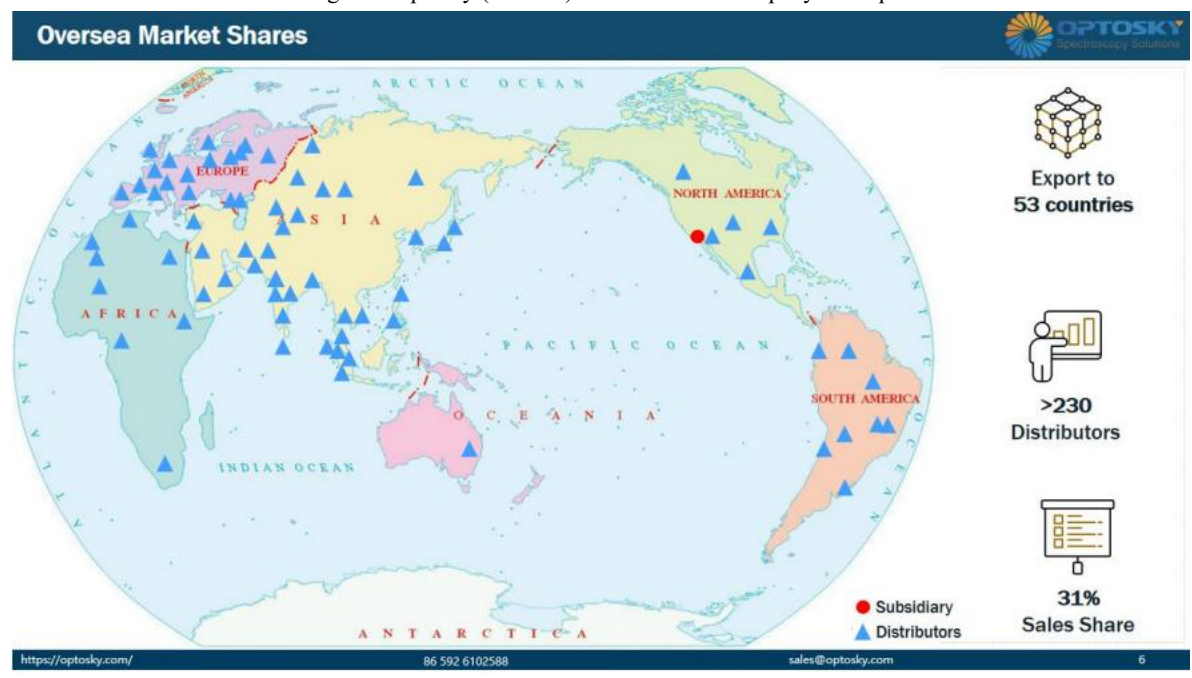
Figure 2 Oversea Market Shares